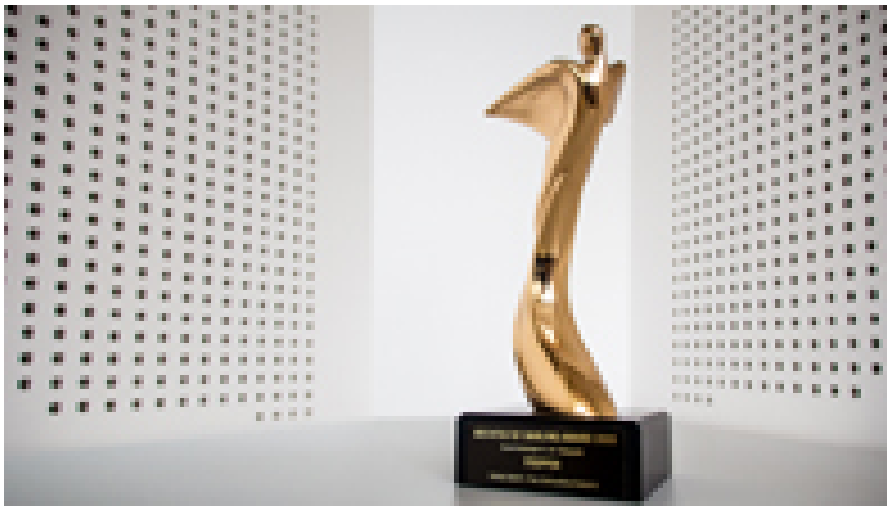
Gold for the Schöck Tronsole at the Architects' Darling 2020.