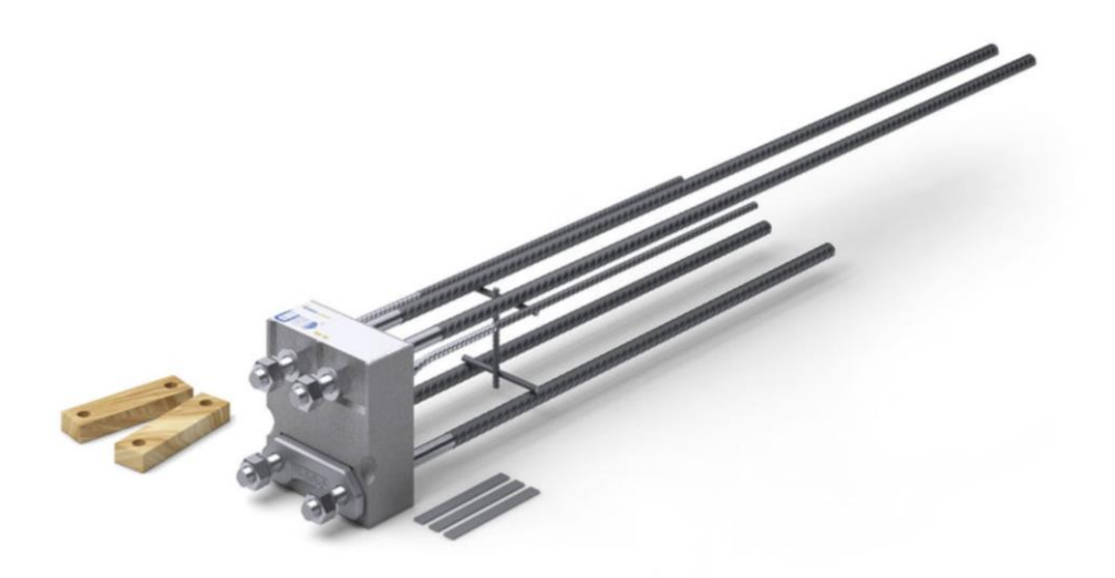
The Isokorb Type KS – Schöck Ltd