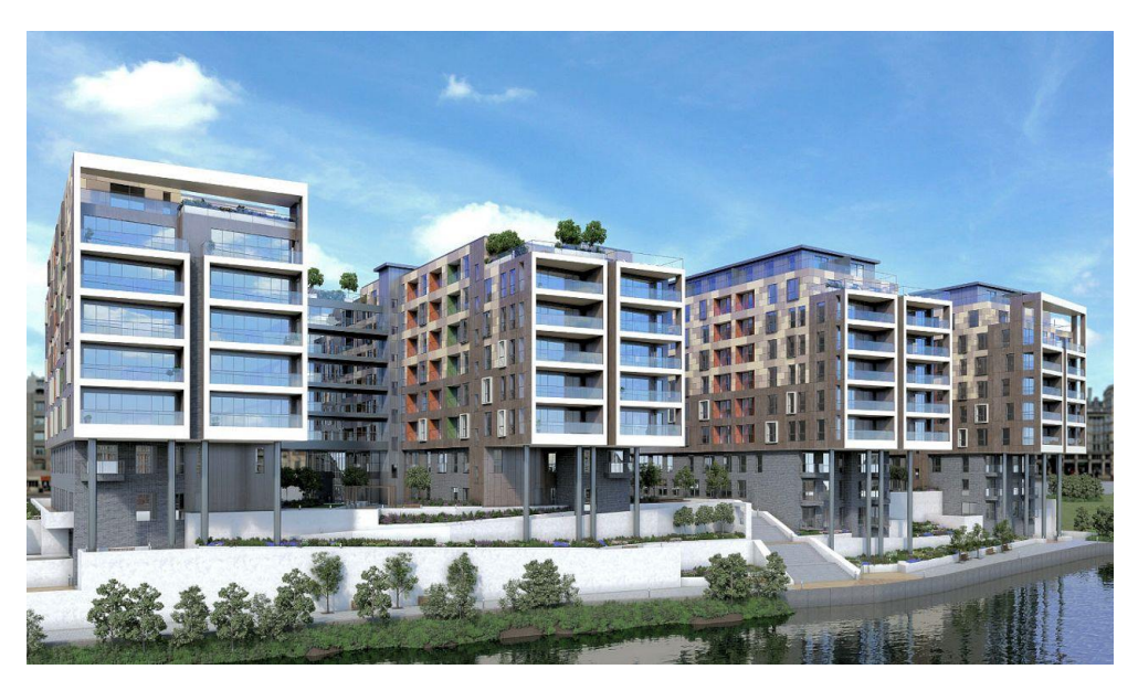
External phase Adelphi Wharf - Courtesy of Fortis Developments