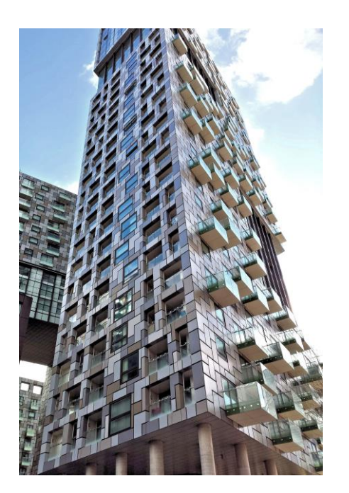
Part of the Harbour Central complex.