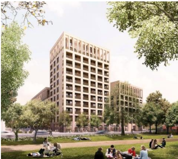
Architects image of final project courtesy of Karakusevic Carson