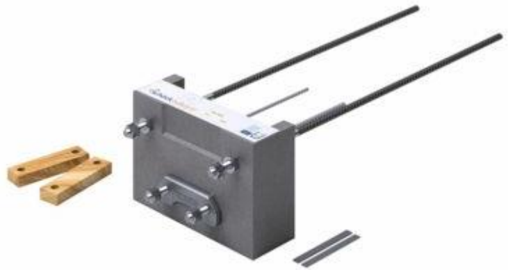
The Isokorb type RKS