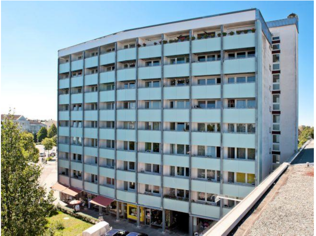
An example of a finished retrofit installation