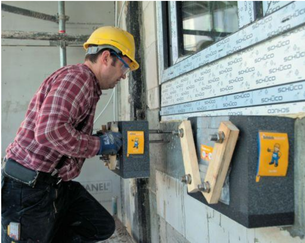
The Isokorb type RKS being installed