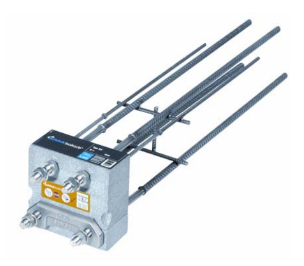
The Isokorb type KS20