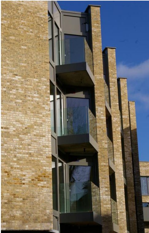
[Chester Balmore Balconies.jpg]

Schöck Isokorb not only thermally separates components from one another, but also acts in a structural design capacity as well.