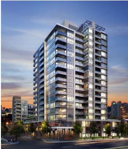
[Lido residential tower.jpg]

LIDO residential tower rendering – Schöck is honoured to announce plans to include Isokorb® thermal break solutions in LIDO, a 21-level residential tower in False Creek, Vancouver, Canada.