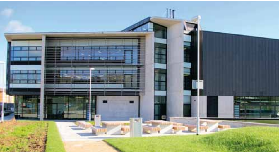
The new East Park Design Centre at Loughborough University