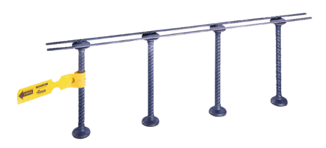
FIGURE 1—SCHÖCK BOLE SR STUD RAILS

SCHÖCK USA, INC. 281 WITHERSPOON STREET SUITE 110 PRINCETON, NEW JERSEY 08540 (855) 572-4625 www.schoeck.com